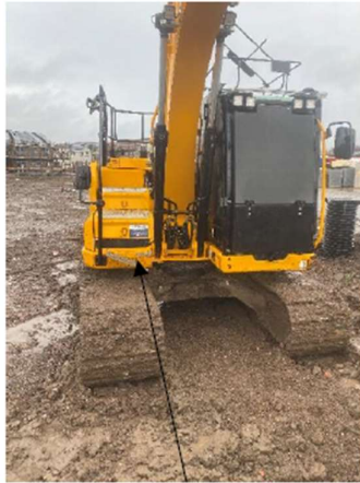
Operator fall position